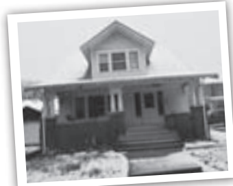
The new home of Diaper Heaven is 733 S. 13th St.

God cherishes the life of every human being. If he did not, he would not have created life nor would he have redeemed life. Jesus died on a cross for every sin and evil to pay the