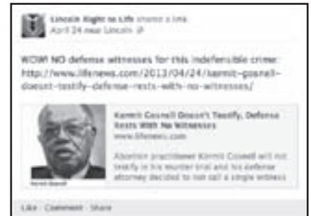
Lincoln Right to Life and others helped spread information regarding the trial through social media, including Facebook, due to a lack of mainstream media attention.

— From the National Catholic Register, May 15